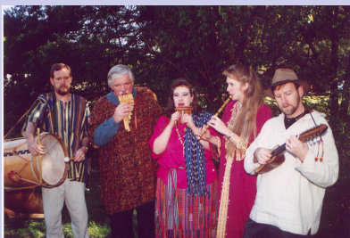
Praise Him with the stringed instruments and the flutes! ...Let everything that has breath praise the Lord! Psalm 150: 4,6

Music is one of the most powerful ways to communicate in any culture, and every culture has its own forms of music. We want to encourage the use of culturally meaningful music to effectively communicate the gospel and lift praise to Jesus, the King of Kings.