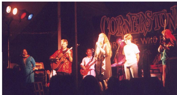
Partnering with Wycliffe Bible Translators' World Music Band at the Cornerstone Music Festival

We are looking to the Lord to provide for our needs through members of His Body who desire to be personally involved in this work. In this way we believe He will continue to confirm the calling and direction He has for us. Please contact us if you would like to be on our personal prayer support team and/or financially participate in our ministry. We'll be happy to give you as much detailed information as you want.